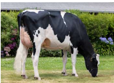
Soleil, daughter of Pellegrino