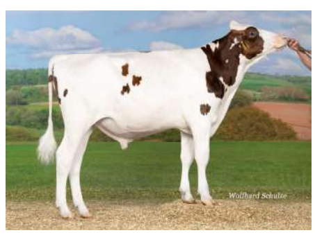
Cop Red PP (S. Cartoon P)