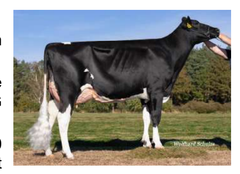
Pellegrino daughter: WEH Linnea VG-85 1. Lactation (Owner: Hintze, Trebel)