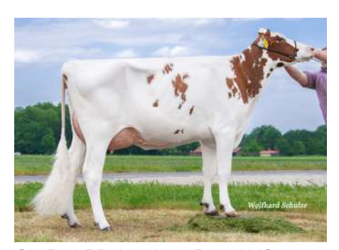
Six Red PP daughter: Bömsi VG-86 1. Lactation (Owner: Lehmberg, Jameln)

This is just a small excerpt from the interesting portfolio of SYNETICS. We will shortly be presenting our current range of bulls in more detail here.