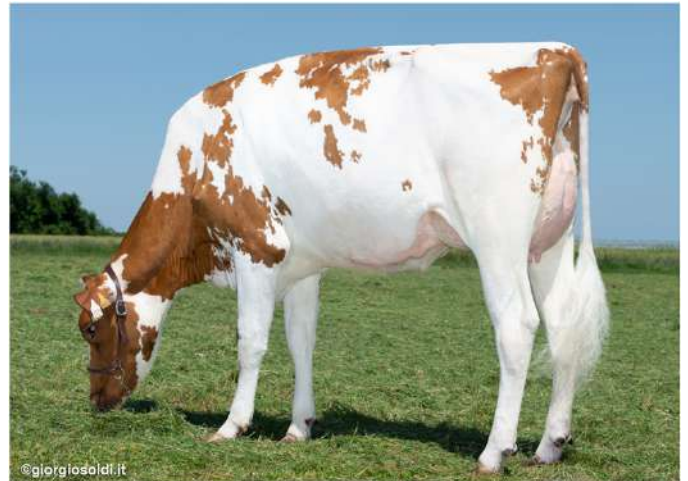
Saluden Paprika VG-86, granddam of Uheleg PP

→ On the confirmed side \geq of 90 REL we are proud to have Pradenn at 172 of ISU and its very balanced profile. Nove , grandson of Ladd P Red Izisa P, grand champion at SPACE 2027 still at +3.0 in udder health and +2.6 in type. Olist P with 428 daughters and still at +2.9 in type.