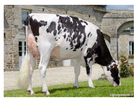
St Yorre, daughter of Pellegrino