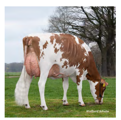
RS Rosi VG-88 (S. Spark Red)

This is just a small excerpt from the interesting portfolio of SYNETICS. We will shortly be presenting our current range of bulls in more detail here.