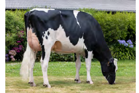
La Soleil (S. Pellegrino)