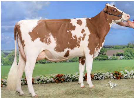
Sybelle, Daughter of Okaidi Red – GAEC Faugeras (63)