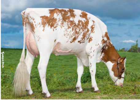
Melistar TB88, dam of Olist P – EARL Jolle (29)