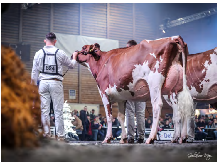
Taillemau Avatar Merry Int. Champion Junior Expo Bulle 2023

On Top, offspring from our Type segment keep to impressing judges and audiance around the world.