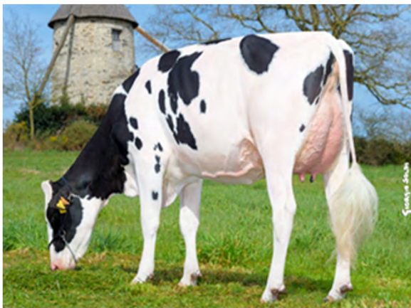
Reine, dam of Tarok P and Topgun