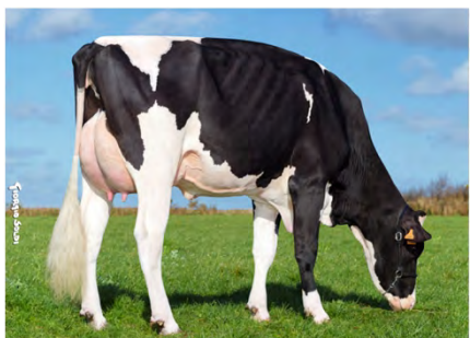
Dam : Riquita VG85 3y00m