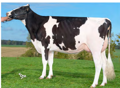
Dam : Ruby GP82 2y4m