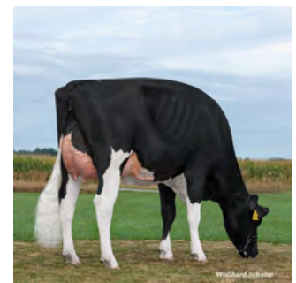
SHo Beauty VG-86 (S. Topstone)