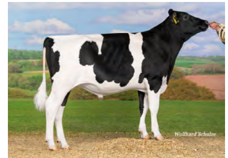
Zirkel (S. Zivet)