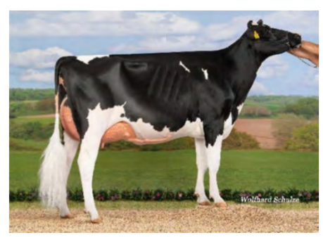
Godja VG-86 , daughter of Topstone Owner: Weser-Milch Lünschen KG, Büttel.