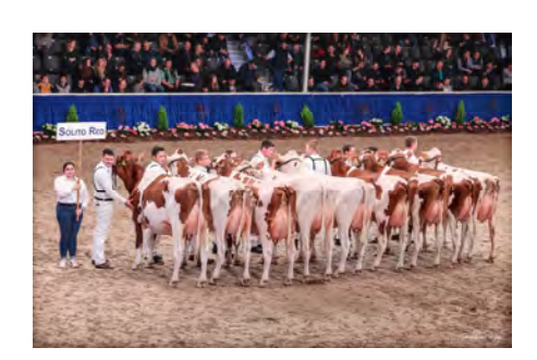
Solito Red daughter group at Schau der Besten 2023