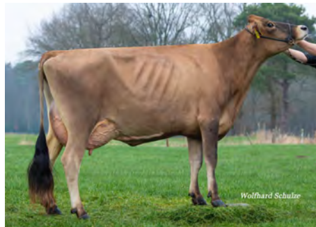
Crystal P daughter Jessy Breeder: Eiting, Wiefelstede