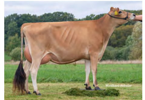
Dilbert-P daughter Ulijana Breeder: Jäger, Kirchlinteln

We are looking for sires that combine positive performance and the highest possible DPR. A faultless linear from a deep cow family completes our claim.