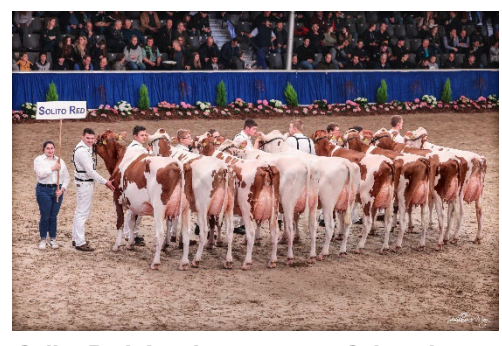
Solito Red daughter group at Schau der Besten 2023

This is only a small excerpt from the interesting portfolio of SYNETICS. Shortly we will present you our current bull offer in more detail.