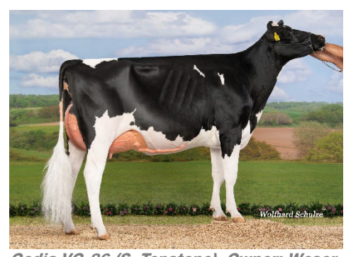
Godja VG-86 (S. Topstone), Owner: Weser-Milch Lünschen KG, Büttel

- Complex gains 7 points in RZG with now over 1000 daughters. at the auctions underline the qualities of these bull.