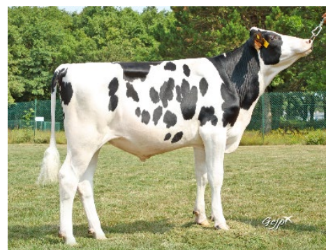
TAMACK P World N°1 ISU

Innovating & exclusive genetic solutions are bringing impact for breeders :