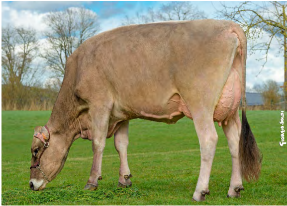
RAIPONSE (O Malley x Amor x Zephir) 38 kg/day Same family as PACTOLE