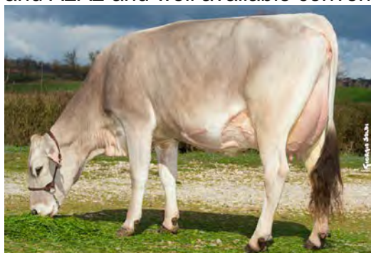
LANCELOT, dam of OSBOURNE

He added just 24 daughters in the production proof and makes a very good start. His daughters are producing very well with nice fore udders. They show a lot of power in the front end and good muscularity considering the production. He went up in ISU to 172 pts and now 1332 GZW CH and 156 PPR. He is AB and A2A2 and well available conventional semen.