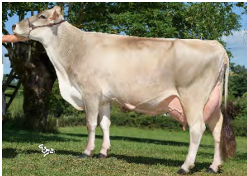
MADMOISEL, dam of Saturne

Born at Gaec Brast in Aveyron, SATURNE has the ideal package of production, fitness and nice udders, This OPTIMAL son has a deep pedigree behind, back to the famous Hussli TIGELLE EX 90 and its 130,000 kg lifetime production! He gets a high GZW CH at 1449 pts and has the sought-after BB and A2A2 caseins. He is widely available conventional and sexed.