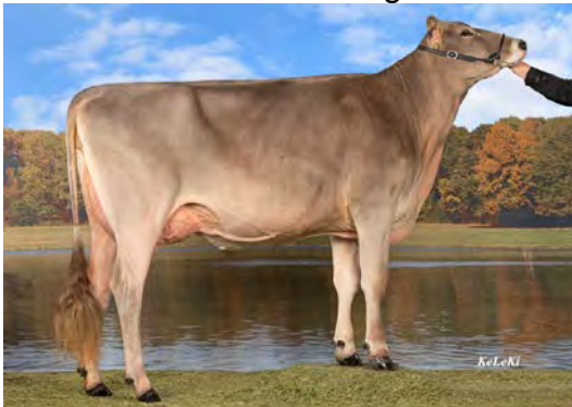
Duss BS O Malley KENAYA

IGBS : reserve Junior Champion Brown Swiss Master Sargans : 1 st in the class