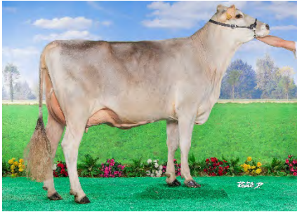
PARRURE, daughter of NICE GP

with 95 of reliability, he becomes a highly reliable proven sire, and has an incredible combination of udders +2.2, fertility +1.8, udder health +2.0, chest width +1.4 and positive muscularity, along with over 450 kg milk on 270 daughters. Cows built to last!