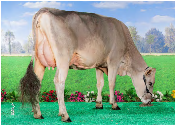
REVEUSE KS (O Malley x Amor x Zephir) Best udder at Miss BGS show PARIS