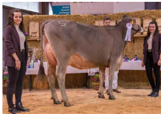
O Malley OSMEA : Bundner Braunviehtag : 1 st in the class