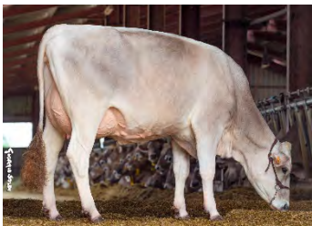
OHEA ABF, dam of Skyfall

He ranks at the top of several genomic lists, with 1434 GZW CH he is in the top in Switzerland and number 10 of foreign bulls in Germany at GZW 133. His family traces back to a great cow in Switzerland Zeus CH ZEA EX 94 who produced lifetime 117,943 kg 4.68 %F 3.62 %P. SKYFALL is a good choice to improve milk production without sacrificing udder quality, muscularity and all fitness traits! He offers the sought-after BB and A2A2 caseins, available in conventional and sexed semen.