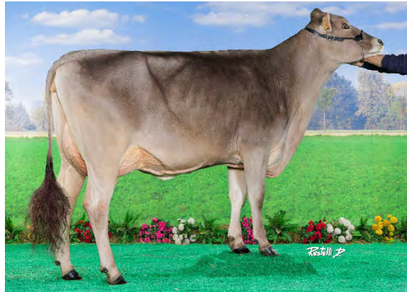
LBB RIXIE (O Malley x Anibal x Hulk) Reserve Miss BGS show PARIS