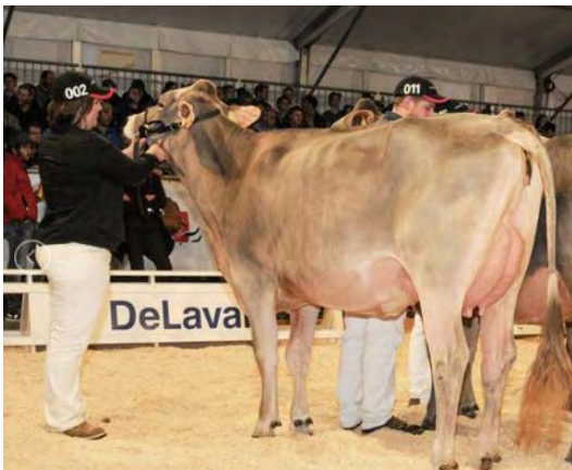
Duss BS O Malley KENAYA :

Meanwhile many of his daughters are performing well on farm and also on some shows :