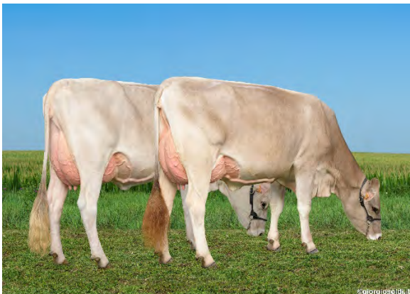
RACHIDA and ROMANE Two O Malley daughters at Sommet Elevage 2022