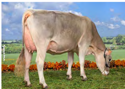
ROSALIE (No Decibel)

He added now 71 daughters in the production proof and 21 in the type evaluation. He confirms to be an exceptional udder bull with 127 in the CH base, also +2.2 in France and remains a complete bull with excellent feet and legs and correct production. He is AB and A2A2 and well available conventional semen.