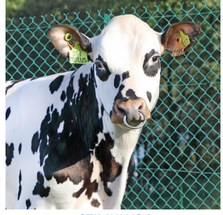
STIMULUS P Nacre x Navidad x Game Over x Gameiro x Foirail

The polled gene has been introduced through others dairy breeds already carrying polled gene as Red Holstein or Pie Rouge. Double carrier polled heifers were selected and collected with top Normande bulls in sexed semen. The polled daughters were inseminated by the same way for 5 generations until getting the full Normande official pedigree.-STIMULUS P is from the 5<sup>th</sup> generation with TOP Normande semen.